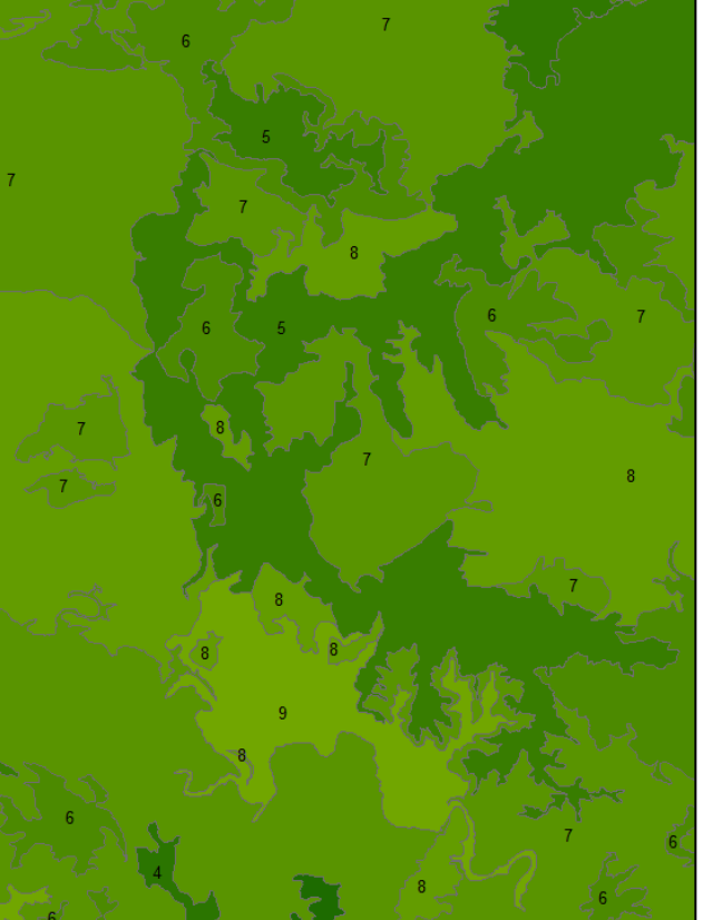
Rigid boundaries vs soft boundaries